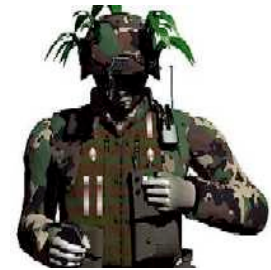
Figure 2: Blue Force Tracking Application

An intended application of the RF Tag family is blue force tracking (Figure 2) with obvious extensions to any high-value asset /inventory control system.